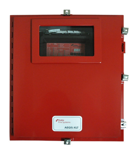
AEGIS-XLT (NEMA 4)

For Commercial, Outdoor (Weatherproof) and Industrial (Dust Tight and Oil Resistant) applications, the AEGIS-XLT is available in NEMA 4 and 12 versions. Both versions can be equipped with an optional heater for operation below 32 degrees F. The NEMA 12 enclosure has a door mounted handle for easy access.