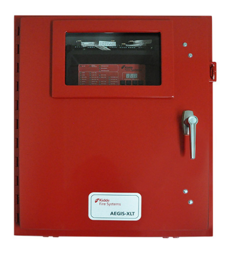
AEGIS-XLT (NEMA 12)