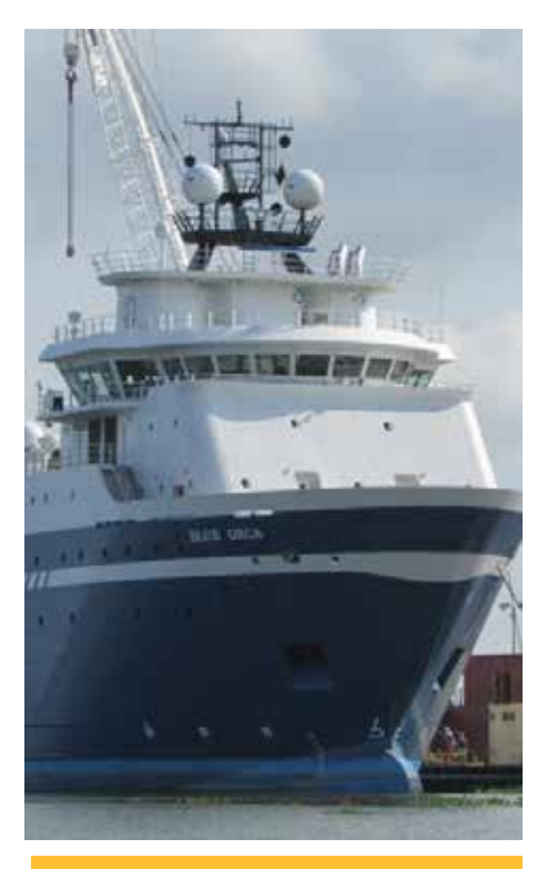
The Blue Orca has both a Kidde® ECS™ Clean Agent System with 3M™ Novec™ 1230 Fluid and a Kidde High-Pressure Carbon Dioxide System installed onboard. Our systems are protecting the Engine Room and Casing, Emergency Generator, Brake Frac Pump, Sand Silo and Generator Rooms.